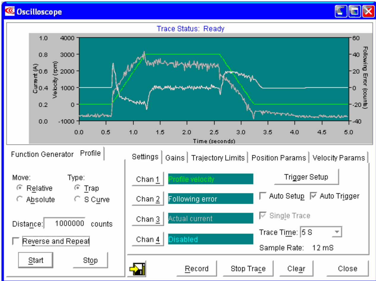
Image of CME2 Software's Scope Screen using the Profile tab. Using Harmonic Drive Systems FHA-17C-100-D250 1rev at 30rpm at output shaft is 100rev at 3000rpm at the internal motor shaft.